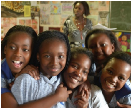
The children of Masibambane College in Orange Farm SA wanted to say thank you for updating their Fire and Safety equipment - paid for by funds raised at this year's Awards dinner

The May Fair is an elegant five-star hotel, situated in one of London's finest central locations.